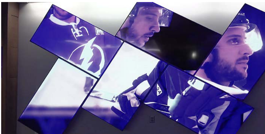
Tampa Bay Lightning, Florida, USA

An important goal of the 2015-16 upgrades was ensuring a premier fan experience. The management team at Amalie Arena wanted to make sure that everyone who came to the arena had an exciting and unforgettable time in a one-of-a-kind venue. Part of that vision was an upgrade to the fans' digital experience. The team created conceptual renderings for some mosaic-style video walls—unique artistic layouts they wanted to deploy in key points around the arena. They wanted to turn standard video walls into pieces of art to showcase stunning views of the city and other local content, all of it in 4k UHD resolution.