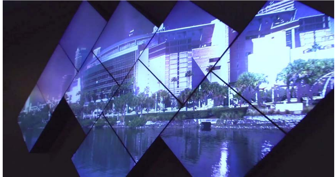
Tampa Bay Lightning, Florida, USA

Userful Corporation is a leading centralized display software company that makes it simple and affordable for organizations to implement and centrally manage video walls, virtual desktops and beyond with exceptional performance. Userful is the trusted provider of over 1 million centralized displays in over 100 countries.